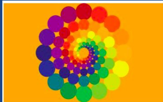
Prejudice Reduction and Collective Action: Integrating the Anti-Bias Framework into All Disciplines