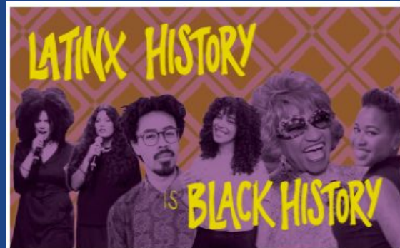
Latinx History Is Black History